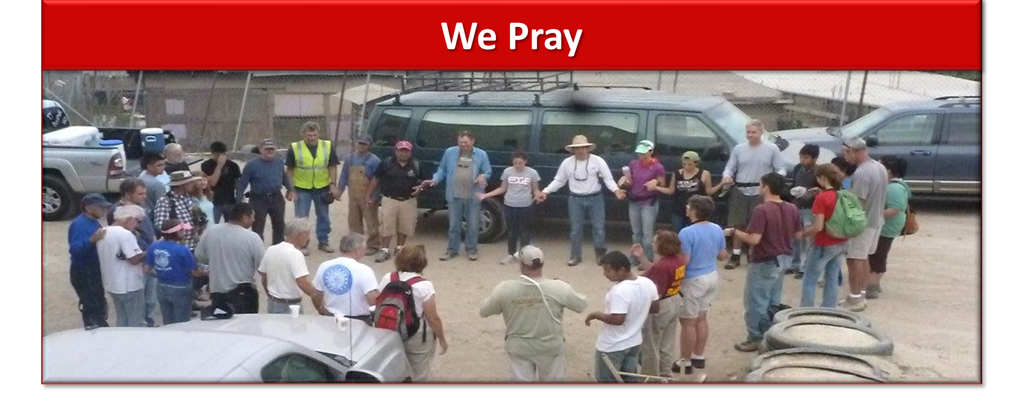
Lord Jesus, Carpenter and Healer,

We ask that you look upon the multitudes in Tijuana who have too little to eat, have too little shelter, and struggle each day to find work and ways to care for their family. We pray for the sick who have little resources to be healed. We ask you to guide us and open our eyes and hearts to their plight. Help us to hear their voices and learn from their faith and wisdom. Show us how we can help. In your name we pray. Amen